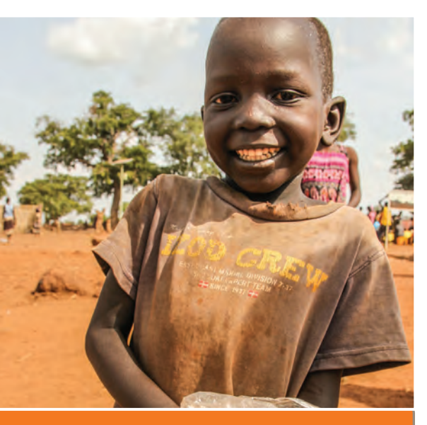
A young boy from South Sudan plays at his new home in Uganda.

'Food is essential to everybody and thus has been used as an important mobilisation tool for child protection. For example, all the 38 Food Management Committees have received training on child protection and have been able to identify and refer vulnerable children, especially child-headed households, and ensure that they receive food. In this way, we have been able to mainstream child protection in food distribution.' – World Vision Staff