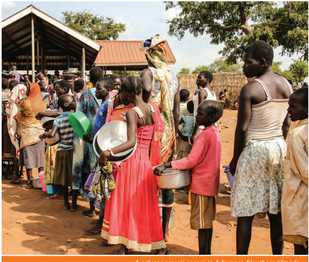
A refugee transit centre in Adjumani, Northern Uganda.

UNICEF Uganda, 'DRC refugee influx to Bundibugyo – Situation Report #3' (30 July 2013).