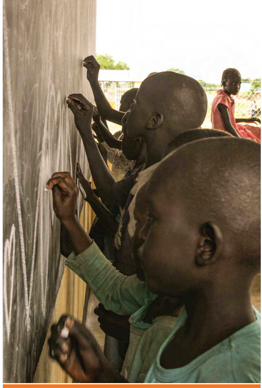
Children in Adjumani, Northern Uganda are having fun at the CFS. They love coming here every day and enjoy speaking to the World Vision staff.