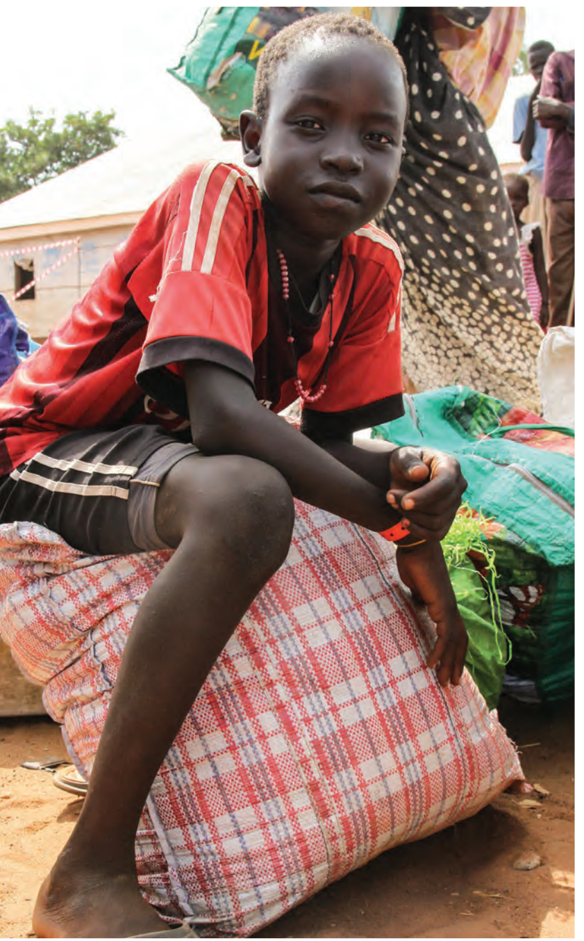
Families from South Sudan arrive at the refugee transit centre in Northern Uganda.

World Vision is a Christian relief, development and advocacy organisation dedicated to working with children, families and communities to overcome poverty and injustice. Inspired by our Christian values, we are dedicated to working with the world's most vulnerable people. We serve all people regardless of religion, race, ethnicity or gender.