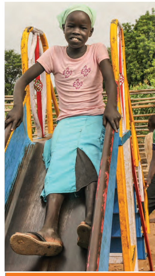
This young girl and her family live in Uganda after fleeing violence in South Sudan.

In Adjumani, the interagency education and child protection working group's collaboration around the implementation of CFSs/ECD provides a best practice that could be replicated in other emergencies. This included strong coordination with the district local government and the inspector of schools in charge of ECD, who played a critical leadership role and guidance for partners implementing ECD programmes. The local government in Adjumani ensured compliance with national guidelines for ECD to make certain that minimum quality standards were met.